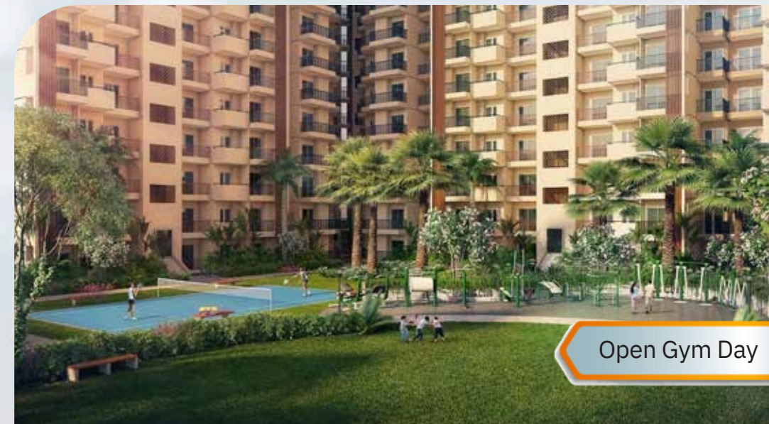
Open Gym Day